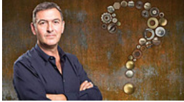
The Why Factor